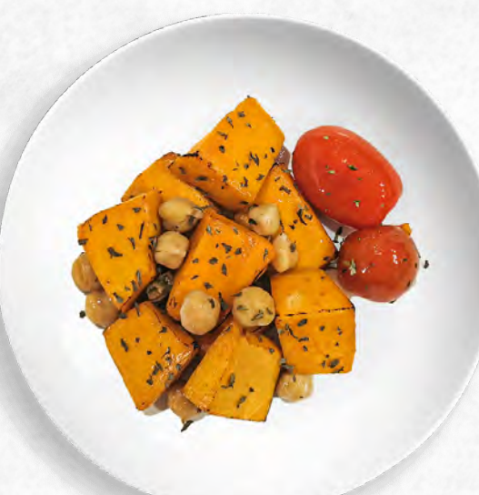
Roasted Pumpkin and Chickpeas in Lemon Dressing

✓ Contains Vitamin A, Vitamin C, and Iron