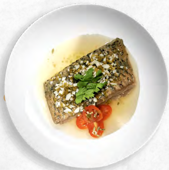
Thai Style Steamed Fish

Our dishes contain lactogenic ingredients that are traditionally believed to support milk supply, including fennel, fenugreek, green papaya and more!