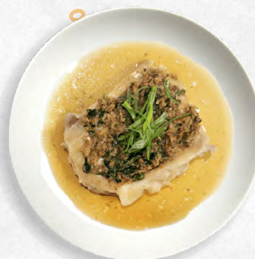
Braised Chicken with Ginger and Coriander Sauce