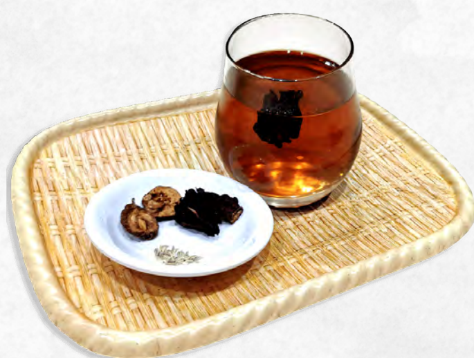
Roselle Black Dates Drink

Included in every meal, different drinks daily!