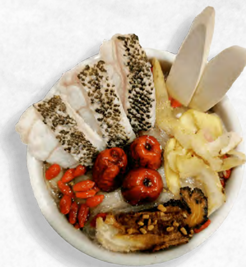
Fenugreek Fish Soup