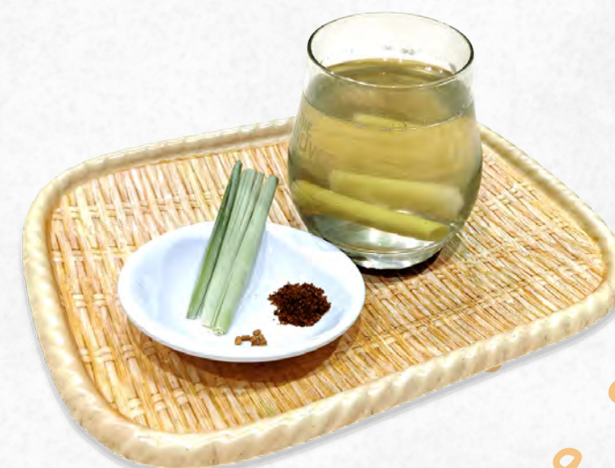
Lemongrass Fenugreek Drink