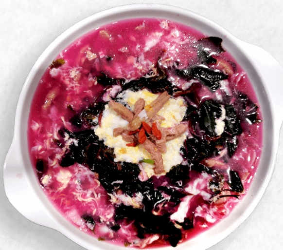
Red Amaranth Soup with Egg White and Pork Strips

✓ Contains Iron, Protein, Vitamin B Complex & Vitamin C