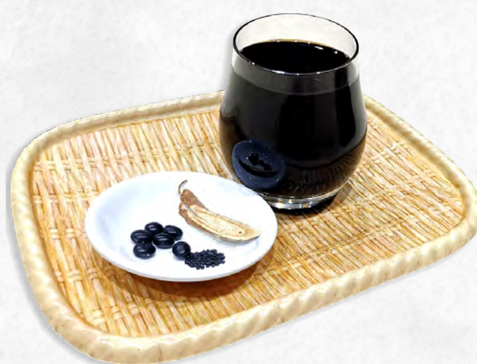
Black Bean Black Sesame Drink